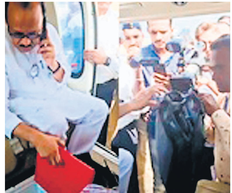
Team Absolute | Mumbai

Amid Thackeray's criticism, poll panel officials check choppers of Maha CM and DCM