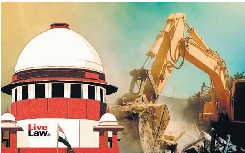
Team Absolute | New Delhi

Laying down pan-India directives governing demolitions of unauthorised structures, the Supreme Court on Wednesday cautioned that flouting its directions by state officials will result in criminal contempt and prosecution. After several petitions were filed before the apex court alleging that demolitions were carried out by several state authorities without sufficient notice, a Bench of Justices B.R. Gavai and K.V. Viswanathan issued a slew of directions under Article 142 of the Constitution. In an interim order passed on September 17, the Justice Gavai-led Bench paused all demolition actions across the country, except with its permission.