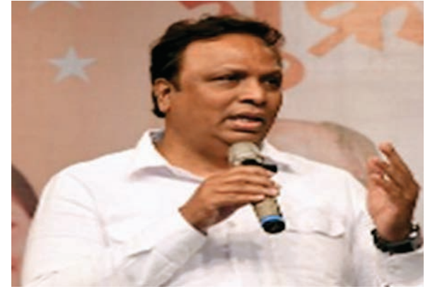
submitted that the names of voters who had exercised their voting rights during the 2019 Lok Sabha elections went missing during the 2024 elections. "As a result, these voters could not cast their votes. Interestingly, there are a number of such voters in Maharashtra. Why did these names disappear? How did they disappear? At whose behest did they disappear?"

A detailed report of the voter registration campaign was presented to the commissioner. The delegation