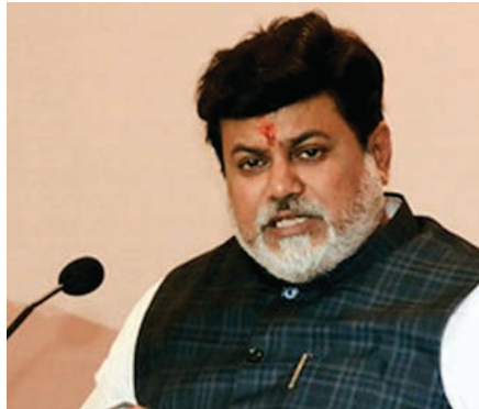
demands. This movement prompted the state government to conduct an extensive survey of the Maratha community. Nearly 1.58 crore households were surveyed at a cost of Rs 337 crore in just 12 days, a feat unprecedented in the world. Based on the survey's report, the state government announced a 10 per cent reservation for the Maratha community," he said, and asked Jarange-Patil to consider these positive actions by the government.

"The government has responded positively to the movement and attempted to address its