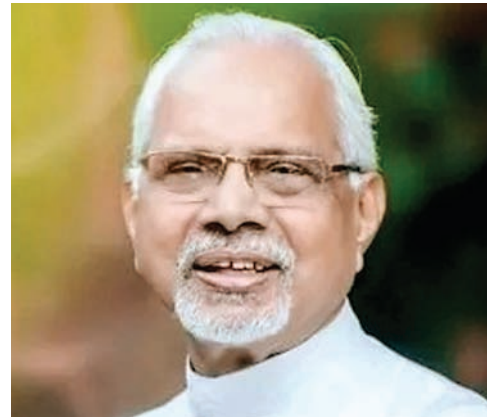
format that took him over 13 years from 1997 to complete, which became an instant best-seller with over three reprints.