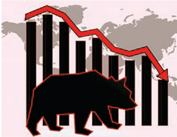
Axis Bank, JSW Steel, Tata Steel, ICICI Bank, UltraTech Cement, and Power Grid are the top losers. Tata Motors, L&T, HDFC Bank, and ITC are the top gainers.

Twenty-four out of 30 Sensex stocks are trading in the red.