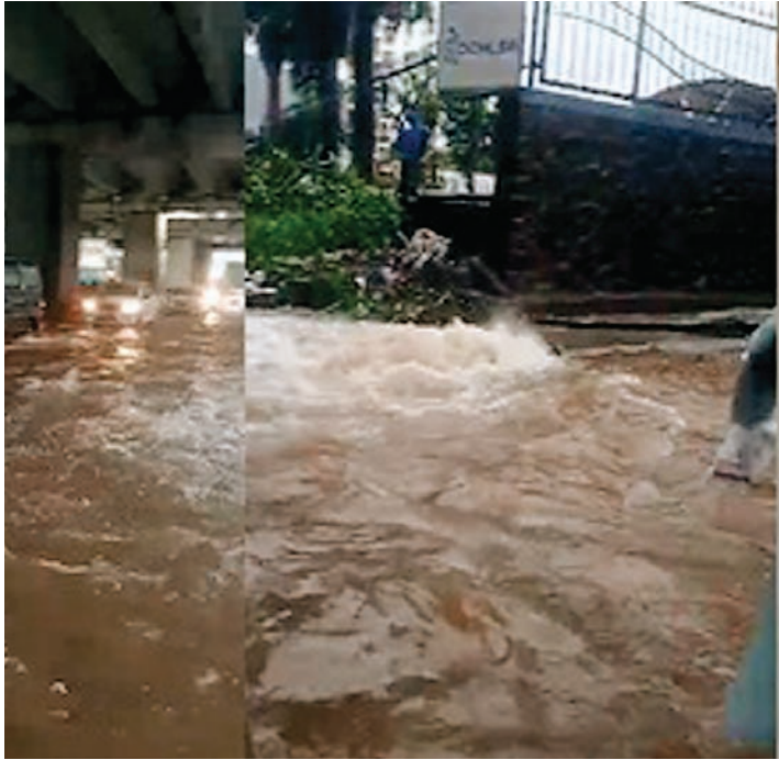
leaving a trail of destruction, paralyzing normal life as the district administration ordered all educational institutions to remain shut for the

The state's cultural, academic and IT capital has been clobbered by torrential rain since Wednesday night