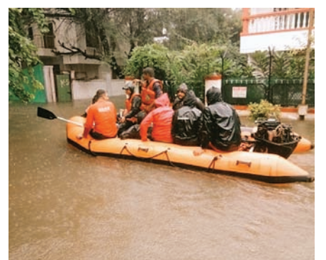
Ajit Pawar also instructed that rescue and relief be provided to citizens immediately even as he urged citizens to take necessary precautions to protect themselves from heavy rains and floods. He urged the citizens to contact the nearest administrative agencies in emergencies, and to avoid going out unless it was absolutely necessary.

From the Control Room, Ajit Pawar contacted the Municipal and Divisional Commissioners to gather information and instructed them to remain alert for rescue and relief operations. He emphasised the importance of staying in touch with NDRF officials to ensure that their assistance was readily available. The Deputy CM stressed that arrangements for shelter and food for affected citizens should be made and the state administration and disaster management agencies should work in coordination with district agencies.