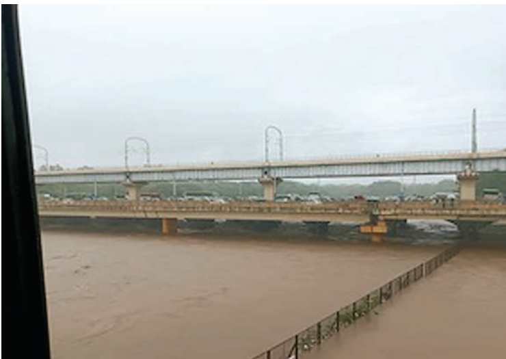
"The units of NDRF, SDRF, Army, Navy, Police, Fire Brigade, Health System have been directed to coordinate with each other and lend help,"

"I have spoken to the Army and Navy officials related to Pune. I have asked for deploying helicopters to rescue people trapped in various places due to floods," said Shinde.