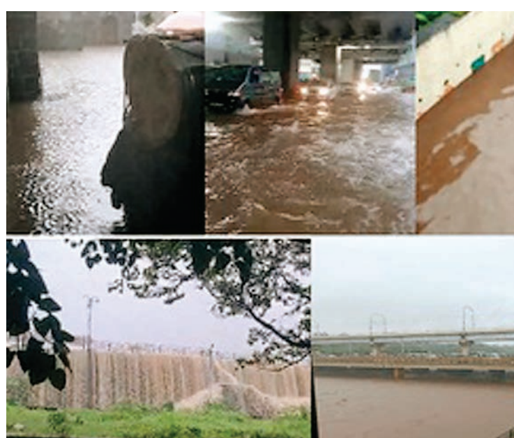
Minister of State for Civil Aviation Murlidhar Mohol, the Pune MP.

The situation was compounded by over 40,000 cusecs water being discharged from the overflowing Khadakwasla Dam, said Union