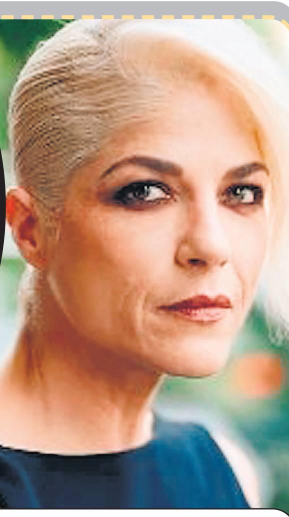
Los Angeles | Agencies

Selma Blair on being diagnosed with multiple sclerosis: I became much happier