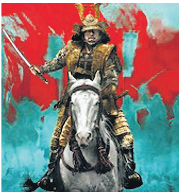
Los Angeles | Agencies