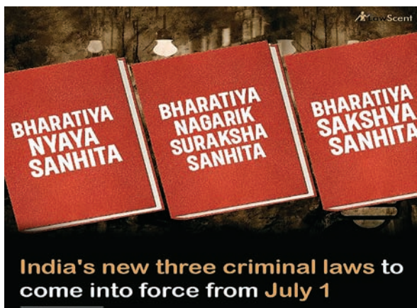
India's new three criminal laws to come into force from July 1

India has completely overhauled its criminal justice system with three new criminal laws coming into effect today. The Bharatiya Nyaya Sanhita (BNS) replaced the Indian Penal Code (IPC); Bharatiya Nagrik Suraksha Sanhita (BNSS) replaced the Code of Criminal Procedure (CrPC), and the Bharatiya Sakshya Adhiniyam (BSA) replaced the Indian Evidence Act. The three laws were passed in parliament in December 2023. The three new laws focus on justice rather than punishment and are aimed at providing speedy justice, all the way, strengthening the judicial and court management system emphasising "access to justice by all". The criminal justice system in India after Independence has not delivered the results because of certain inherent shortcomings including substandard investigation and prosecution, large pendency of criminal cases, delayed court proceedings,