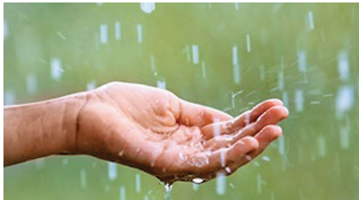
Maharashtra. This resulted in scorching heat waves in northwest India and prolonged dry conditions in West Bengal, Odisha, Jharkhand, Bihar, Chhattisgarh, Madhya