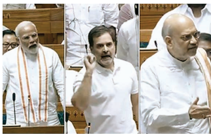
Congress MP and said, "Calling the entire Hindu community violent is a very serious matter."

Rahul Gandhi's maiden speech as the Leader of the Opposition (LoP) in Lok Sabha was marked by huge pandemonium and uproar in the Lower House on Monday. Starting off his speech, the Congress MP waved a copy of the Constitution and also the photo of Lord Shiva while launching a broadside at the ruling Bharatiya Janata Party (BJP) and its ideologue Rashtriya Swayamsevak Sangh (RSS). Rahul's reference to 'Hindus' drew strong protest from the BJP MPs and also a rare intervention from Prime Minister Narendra Modi. Home Minister Amit Shah demanded an apology from the Congress MP for 'linking' the BJP with violence. PM Modi stood up to interject the