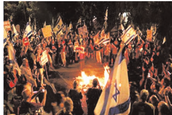
Jerusalem for a protest, according to reports. These are the latest in months of protests as people accuse Netanyahu of bowing

Thousands of Israelis turned out for fresh protests against Prime Minister Benjamin Netanyahu's government in a renewed show of anger at the failure to agree on a ceasefire in Gaza and bring about the return of hostages. According to Israeli media on Thursday, the largest rally took place in front of a private home of the Prime Minister in the city of Caesarea. The demonstrators demanded new elections and the release of the hostages held in the Gaza Strip. Hundreds also gathered in