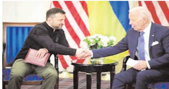
particular missiles for the Patriot and NASAMS air defence systems. These should go instead to Ukraine, whose armed forces urgently need additional air defence capacities, he added. The countries concerned

The US government plans to postpone the delivery of some military equipment to other countries to prioritise strengthening Ukraine's air defences. White House National Security Spokesman John Kirby said on Thursday that given Kiev's urgent needs, the US government had made the "difficult but necessary" decision to postpone certain planned arms sales to other countries, in