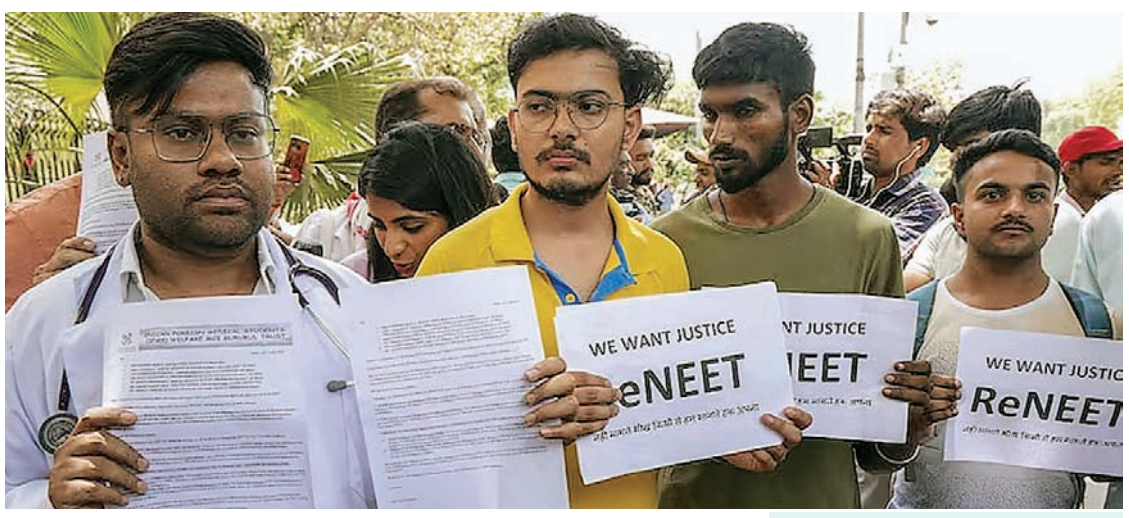
NTA and Union of India may file their response within two weeks. The other respondents may also file their response on or before the next date fixed. "The matter will be taken up for hearing on July 8.

► The National Testing Agency (NTA) on Friday announced the postponement of the Joint CSIR-UGC-NET scheduled for June 25-27, citing unavoidable circumstances as well as logistic issues. In a notification issued on Friday, the NTA stated: "The candidates are hereby informed that the Joint CSIR-UGC-NET Examination June-2024 which was scheduled to be held between 25.06.2024 to 27.06.2024 is being postponed due to unavoidable circumstances as well as logistic issues. The revised schedule for the conduct of this examination will be announced later through the official website." Candidates have been advised to keep visiting the official website for the latest updates.