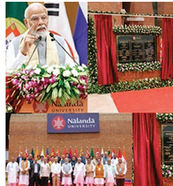
Patna | Agencies

Prime Minister Narendra Modi inaugurated the new campus of Nalanda University in Bihar's Rajgir district on Wednesday and described it as 'symbol of India's vibrant cultural exchange and academic heritage'.