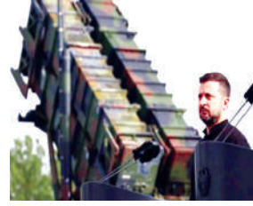
Congress. The US has also been supplying Ukraine with Patriot missiles. The Patriot is considered one of the most advanced air defence missile systems in modern warfare. It can be used to combat enemy aircraft, ballistic missiles and cruise missiles. The defence missiles can hit targets at a distance of around 100 km at altitudes of up to 30 km. Germany has also provided Ukraine with two such systems and pledged to send another one. Zelensky, who was in Berlin on Tuesday to attend a conference for the reconstruction of Ukraine, also paid a visit to Ukrainian soldiers currently being trained in Germany to use the Patriot.

Washington | Agencies US President Joe Biden is planning to make another Patriot air defence system available to Ukraine to fend off Russian aerial attacks, the media reported, citing unnamed US government sources. Biden took the decision following several high-level meetings last week, the New York Times reported on Tuesday. John Kirby, the Communications Director of the US National Security Council, did not confirm the report when asked about it. According to the New York Times, the system in question is in Poland and could be deployed to the front line in Ukraine within days. If confirmed it would be the second US-made Patriot system provided to Kiev by Washington. Biden gave the go-ahead for the first system nearly 18 months ago when Ukrainian President Volodymyr Zelensky travelled to the US for the first time following Russia's full-scale invasion of Ukraine to address the US