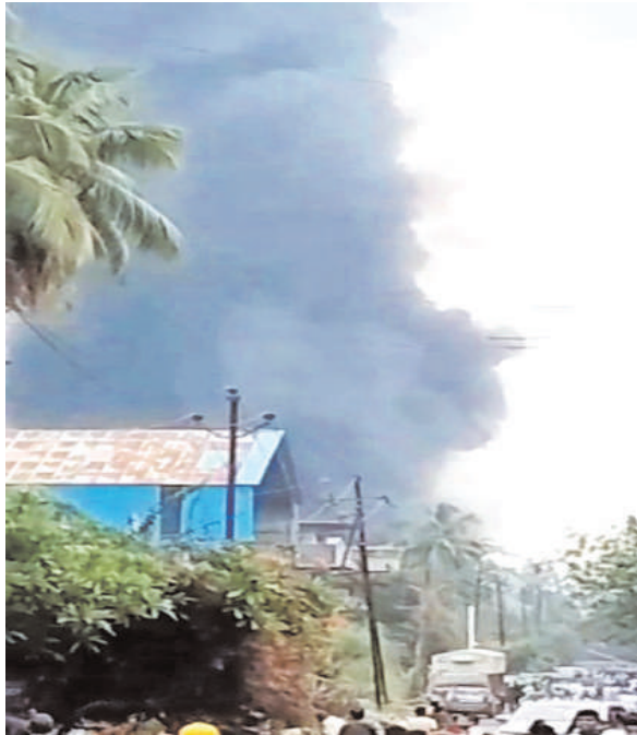
and a school. "Immediately we rushed at least seven fire tenders and launched fire-fighting opera-

According to the Dombivali Fire Control, the fire broke out around 10 am in the Indo Amines Ltd, which manufactures multiple chemicals, at the Maharashtra Industrial Development Corporation (MIDC) complex Phase II, surrounded by thickly populated residential localities