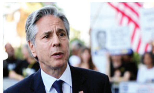
announced in a statement sent via Telegram that it "welcomes" the UN Security Council resolution supporting a ceasefire in Gaza, a complete withdrawal of Israeli forces, and a swap of Palestinian prisoners for hostages held in Gaza. Yet Blinken expressed his anticipation for Hamas leaders in Gaza to provide a clear confirmation of their stance on the proposal, Xinhua