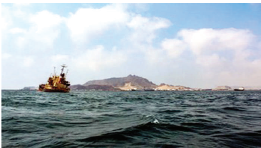
The boat departed from Somalia's port city of Bossaso early Sunday, carrying 115 Somalis and 145 Ethiopians, including 90 women. Despite perilous journeys, thousands continue to transit through Yemen, hoping to reach Saudi Arabia and other Gulf nations. Search and rescue efforts by local authorities were hampered by a shortage of patrol boats and recent conflict in the area. Community members, including fishermen, played a vital role in recovering bodies and assisting survivors, according to the IOM. So far, a total of 71 survivors have been rescued, with eight requiring hospitalisation for further medical treatment. The IOM has mobilised medical teams and psychologists to provide emergency care and mental health support. Since 2014, the IOM has recorded nearly 1,900 migrant deaths along the migration corridor from East Africa to Yemen, which is commonly known as the "Eastern Route".