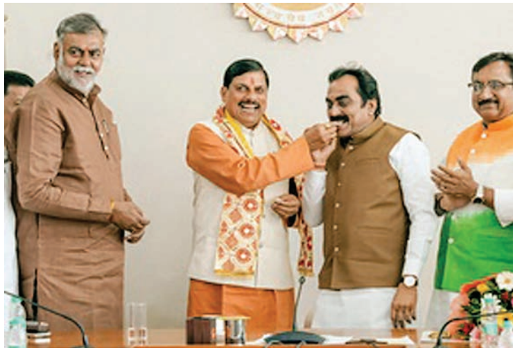
Sabha in 1997.

Last time, Jan Sangh leader Sunderlal Patwa, who later became the Chief Minister of Madhya Pradesh, had won Chhindwara Lok