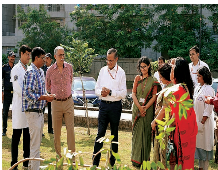
our commitment to fostering a healthier and more sustainable