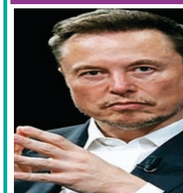
Team Absolute | New Delhi

AN X PHONE WITH SAMSUNG AS A POTENTIAL PARTNER IS NOT OUT OF QUESTION: MUSK