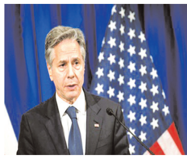
Benjamin Netanyahu has not given clear and public approval to the plan either. Blinken arrived in Egypt on Monday for the first leg of the tour and later held talks with Israeli Prime Minister Benjamin Netanyahu in Jerusalem.

According to the US, only the Palestinian Islamist Hamas movement has not yet agreed to the plan. However, the government of Israeli Prime Minister