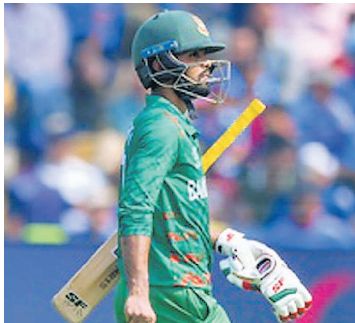
important. Umpires can make a call and they are human too and can make mistakes. They also didn't give

"The laws are not in my hands. In that time those four runs were really