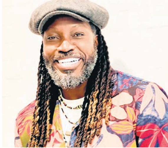
England Champions, Pakistan Champions, South Africa Champions and West Indies Champions.

The England and Wales cricket board has approved the World Championship of Legends, which features six franchises: India Champions, Australia Champions,