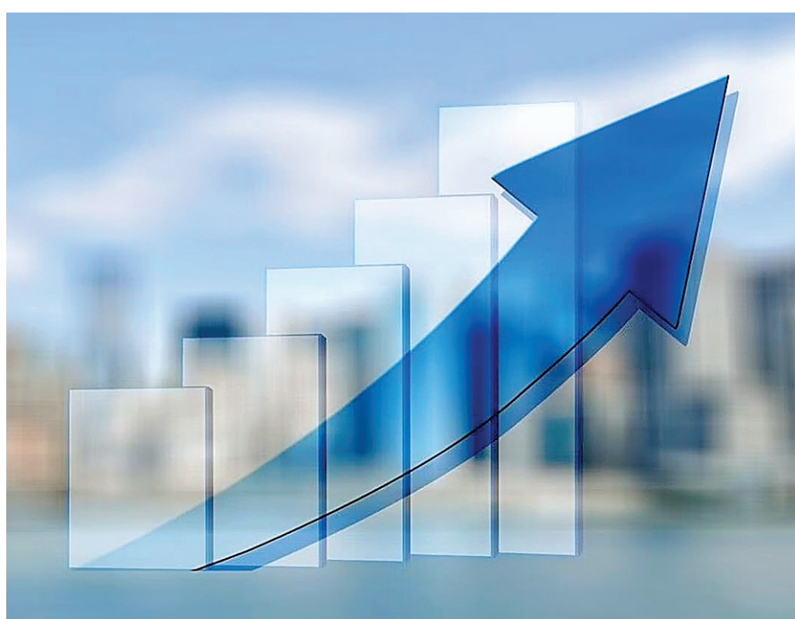
Team Absolute | New Delhi

India will remain the fastest-growing major economy recording a steady growth of 6.7 per cent in the next three years including the current financial year, said a world bank report released on Tuesday. "The forecast implies that over the course of 2024-26 countries that collectively account for more than 80 per cent of the world's population and global GDP would still be growing more slowly than they did in the decade before COVID-19," it said. Growth in the South Asia (SAR) region is projected to slow from 6.6 per cent in 2023 to 6.2 per cent in 2024, mainly due to a moderation of growth in India from a high base in recent years. "India will remain the fastest-growing of the world's largest economies, although its pace of expansion is expected to moderate. After a high growth rate in FY2023/24, steady growth of 6.7 per cent per year, on