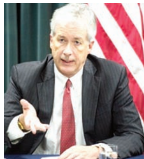
Benjamin Netanyahu and Defence Minister Yoav Gallant.

The top American officials will also reach Israel after meetings in Doha and Cairo. Burns and McGurk will meet Israel Prime Minister