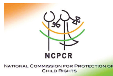
NATIONAL COMMISSION FOR PROTECTION OF CHILD RIGHTS