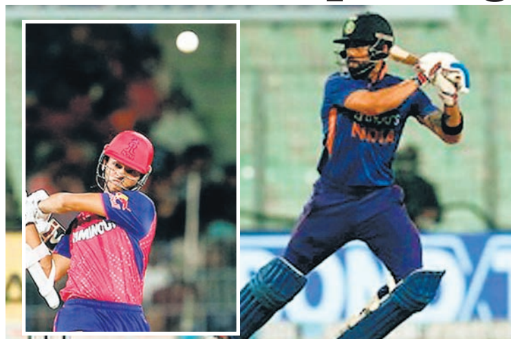
Yashasvi is in good form, and I'm sure he will do well as an opener. With the

"I prefer Virat to play at No. 3 in the World Cup. He's a run machine.