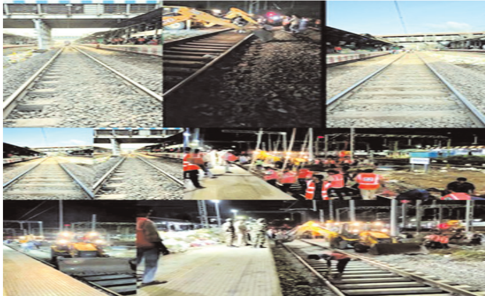
curtailment in services.