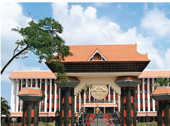
Assembly on Monday decided to pass a fresh resolution.

In a rare instance of unanimity on the floor of the Kerala Assembly, the treasury and opposition benches unanimously passed a resolution moved by Chief Minister Pinarayi Vijayan on Monday seeking to change the name from Kerala to 'Keralam'.