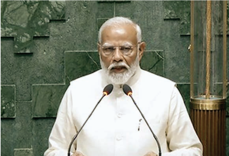
Modi said, "The world's largest election was conducted in a great and magnificent manner. This third term reflects the people's recognition and

The first session of the 18th Lok Sabha commenced on Monday with all the newly-elected members of the Parliament, including Prime Minister Narendra Modi, taking oaths.