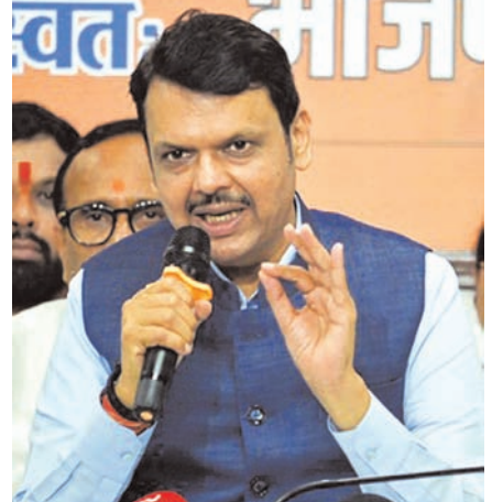
Vikas Aghadi government. Since the farmers should not be penalised, the work to suspend the rate hike is in its final stage. The proceedings will be completed next week," Fadnavis said. "I also request the media to check the fake narratives being spread by the opposition ahead of the Assembly elections. The people of the state should now decide which was the 'Sultani' government," he added.

Maharashtra Deputy Chief Minister Devendra Fadnavis, who also holds the water resources portfolio, on Saturday slammed the Congress' claims that the state government has increased the water supply rates by 10 times. In a scathing post on X, Fadnavis denied Congress' claims as he called the party a "factory of fake news and fake narrative". "Congress is spreading the news that the Maharashtra government has increased the water supply rate by 10 times. But, who made this increase," asked Fadnavis. "On March 29, 2022, the Maharashtra Water Resources Regulatory Authority (MWRA) issued an order and accordingly the rate hike took place. This entire rate hike happened during the Maha Vikas Aghadi rule and now they are accusing us," Fadnavis said. In 2018, the rates for run-off and private pump irrigation were different. However, in 2022, flow-through rates were introduced instead of separate rates for private draws. So it was increased from Rs 500 to Rs 5,000. "This sin belongs to the previous Maha