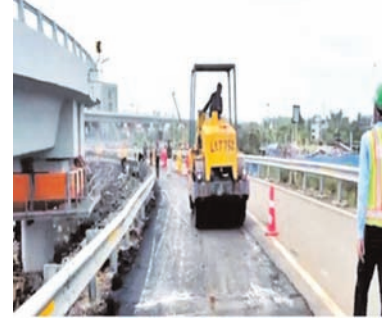
road". It added that the re-patch work on the cracks -- detected at three locations -- has been taken up without disrupting the MTHL traffic. The MMRDA also said that contrary to the rumours, the cracks are not on the MTHL bridge, but on the approach ramp towards Mumbai on the Navi Mumbai end. "The cracks on Ramp 5 are minor longitudinal cracks in the asphalt pavement and do not indicate any structural defects," the MMRDA said. The repair work has been taken up by

The Mumbai Metropolitan Region Development Authority (MMRDA) said on Saturday that the repair work on the approach ramp to the Mumbai Trans Harbour Link (MTHL), also known as the Atal Setu, is in full swing and will be completed by tonight. After a detailed inspection by the MMRDA's operation and maintenance teams, the work started on Friday night despite heavy rain and has continued since then in full swing. Built at a cost of Rs 17,840 crore, the six-lane bridge is 21.8 km long with a 16.5 km sea link connecting South Mumbai and Navi Mumbai. In the past couple of days, there was speculation that the Atal Setu had allegedly developed cracks following which Maharashtra Congress President Nana Patole went to the spot for an inspection on Friday. Meanwhile, the MMRDA has reiterated that "the cracks on the approach road from Ulwe (Navi Mumbai side) are minor and located along the edge of the