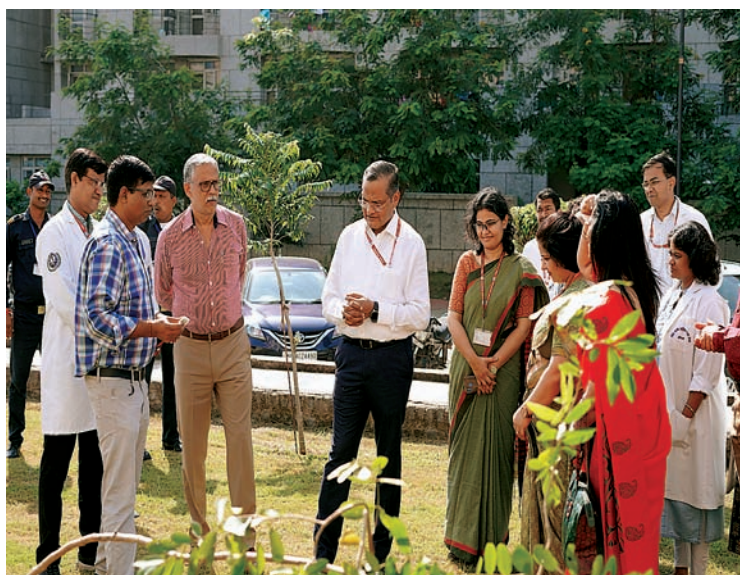
our commitment to fostering a healthier and more sustainable