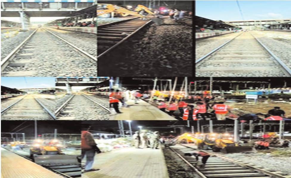
curtailment in services.