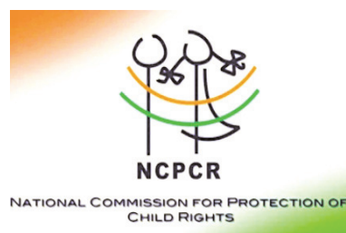
NATIONAL COMMISSION FOR PROTECTION OF CHILD RIGHTS