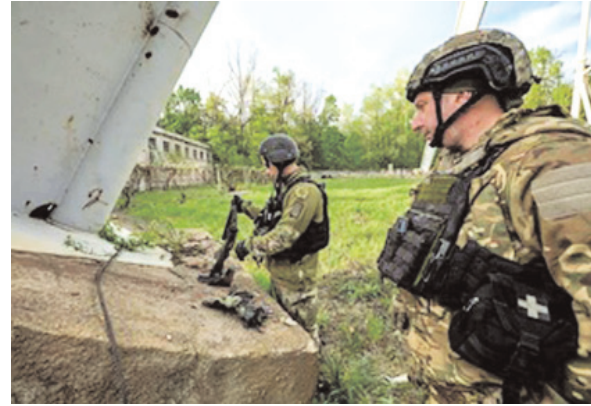
The Russian Ministry of Defence in Moscow announced that Ukrainian combat drones had been intercepted during the night over the Russian regions of Voronezh, Ryazan, Belgorod and Kursk. The Ukrainian armed forces have further developed their drones and have been attacking refineries far into the Russian hinterland

Kyiv/Moscow | Agencies Ukrainian drones have damaged a refinery in Ryazan, some 200 kilometres south-east of Moscow, an unnamed representative of the Ukrainian military intelligence service HUR told the Ukrainska Pravda website. "A military target in Ryazan was hit. There is considerable damage," the website reported. Independent Russian media reported a fire at the Ryazan refinery. The second target was an oil processing plant in the Russian region of Voronezh. The intelligence service did not officially confirm the information, but the Ukrainian press is informed of such attacks in secret.