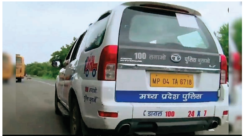
The police have launched a search for the bus driver and conductor who fled the scene after