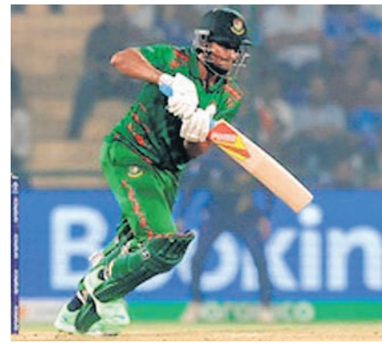
Dubai | Agencies

Bangladesh veteran Shakib Al Hasan and Sri Lanka T20I WC skipper Wanindu Hasaranga with 228 ratings share the top spot in the latest ICC T20I all-rounder in the latest rankings update released on Wednesday. Shakib dropped three rating points to 228 following two appearances at the backend of Bangladesh's recent five-match T20I series against Zimbabwe with Hasaranga joining the