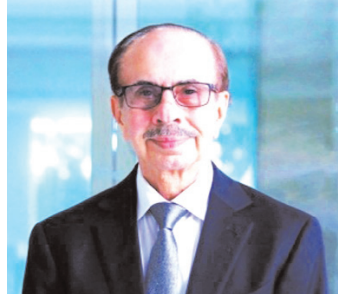
Godrej Properties Ltd., Godrej Agrovet Ltd., and Astec Lifesciences Ltd - will be led by Nadir Godrej as chairman alongside his brother Adi and their immediate families. The five listed companies are collectively valued at Rs 2.4 lakh crore. Pirojsha Godrej, the