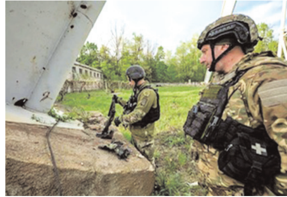
The Russian Ministry of Defence in Moscow announced that Ukrainian combat drones had been intercepted during the night over the Russian regions of

Kyiv/Moscow | Agencies U krainian drones have damaged a refinery in Ryazan, some 200 kilometres south-east of Moscow, an unnamed representative of the Ukrainian military intelligence service HUR told the Ukrainska Pravda website. "A military target in Ryazan was hit. There is considerable damage," the website reported. Independent Russian media reported a fire at the Ryazan refinery. The second target was an oil processing plant in the Russian region of Voronezh. The intelligence service did not officially confirm the information, but the Ukrainian press is informed of such attacks in secret.