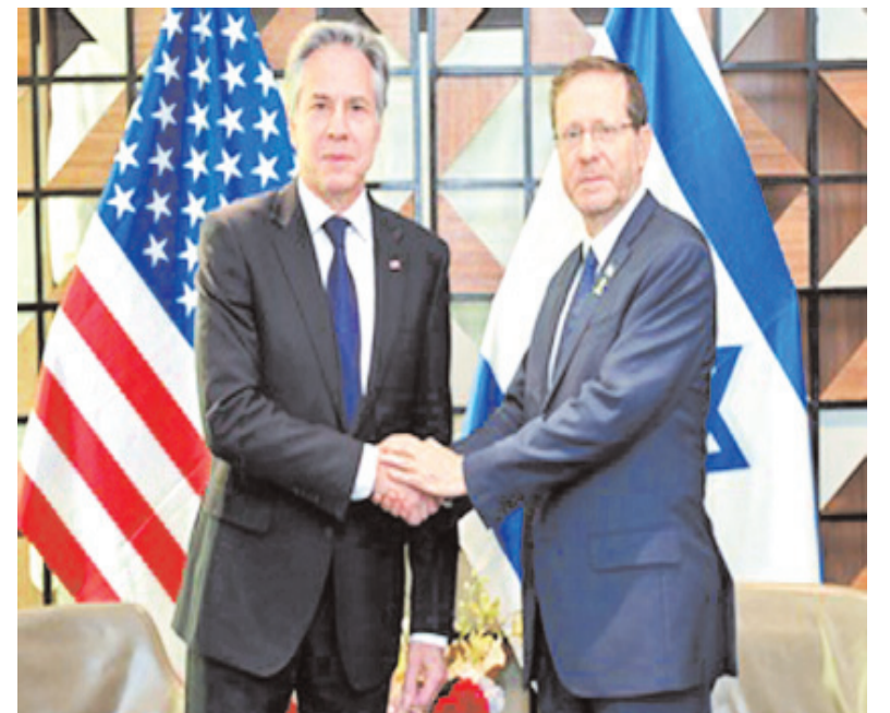
Blinken had previously spoken of a "very, very generous" proposal from Israel for a deal with Hamas. As part of mediation efforts in Cairo, a response from Hamas is now being awaited.

Tel Aviv | Agencies U S Secretary of State Antony Blinken met Israeli President Isaac Herzog in Tel Aviv on Wednesday at the start of a fresh round of talks aimed at bringing about a ceasefire in the Gaza war. The release of the hostages held by the Palestinian Islamist Hamas movement was currently a top priority, Herzog said at the meeting, according to his office. "We're determined to get a ceasefire that brings the hostages home, and to get it now. And the only reason that that wouldn't be achieved is because of Hamas," Blinken said. Blinken said there was a proposal on the table: "And as we've said, no delays, no excuses. The time is now." "At the same time, even as we're working with relentless determination to get the ceasefire that brings the hostages home, we also have to be focused on people in Gaza who are suffering in this crossfire of Hamas's making, and so focused on getting them the assistance they need - the food, medicine, the water, the shelter - is also very much on our minds and in the work that we're doing." Blinken said he planned to discuss these issues with Herzog. A meeting with Israeli Prime Minister Benjamin Netanyahu is planned for later in Jerusalem.