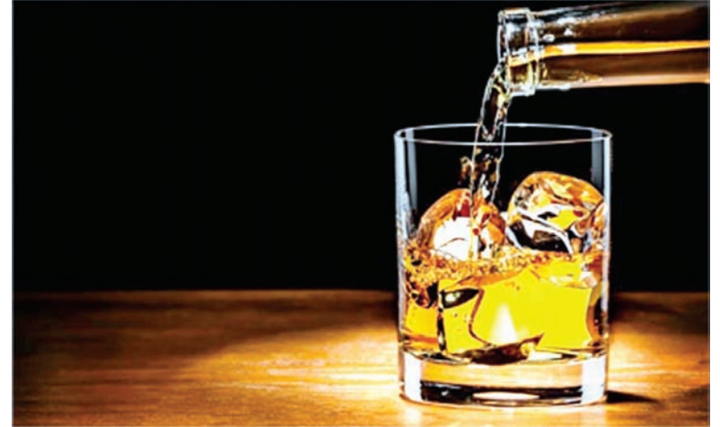
The plea is likely to be heard on Wednesday by a vacation bench. As per the plea, the petitioner association had in April approached the Mumbai City Collector and the Mumbai District Suburban Collector, requesting