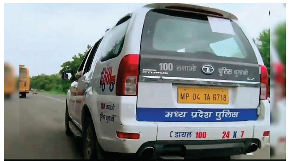
The police have launched a search for the bus driver and conductor who fled the scene after