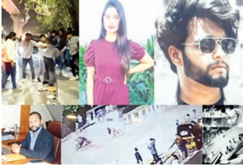
laws against the minor accused.