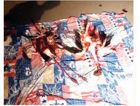
Society, the remains of the dead birds were found strewn in the vicinity of Laxminagar which were collected and taken away for autopsy.

According to experts of the Forest Department and Bombay Natural History