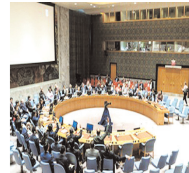
The debate at the United Nations follows US reports in February about Russia's nuclear ambitions in space.

New York | Agencies A UN resolution tabled by Russia against an arms race in space failed in the UN Security Council. The draft resolution received seven votes in favour, seven countries, including the US, voted against it while Switzerland abstained. The measure failed on Monday as it did not obtain the nine votes necessary to pass it in the powerful 15-nation council. In view of a US resolution against nuclear weapons in space that failed last month due to Russia's veto, US representative Robert Wood accused Moscow of manipulative tactics.