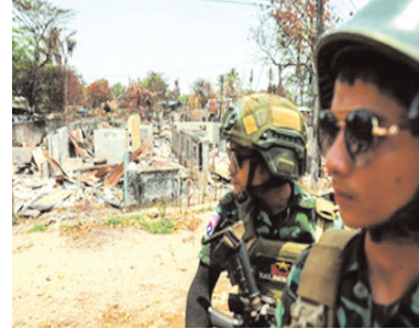
junta shortly after the military coup in February 2021.

In the region, rebels began resisting the