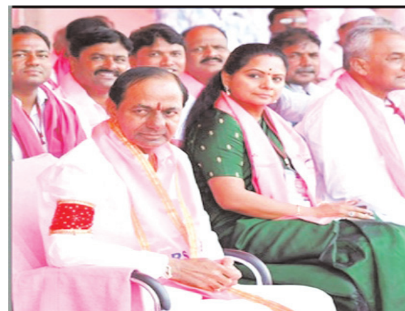
he retained the seat in the 2010 by-election.

In 2009, KCR was elected to Lok Sabha from Mahabubnagar. It was during this term that he succeeded in achieving the goal of Telangana state. KCR's son K.T. Rama Rao made his electoral debut in the 2009 elections with a win from the Sircilla Assembly seat and