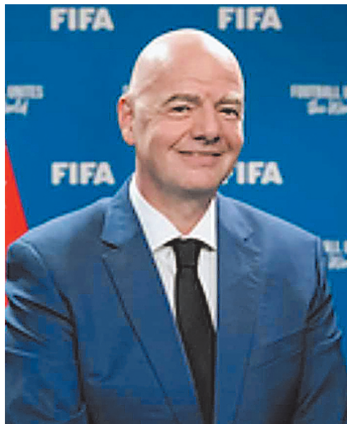
remains level and the game free of malevolent

FIFA president Gianni Infantino has held the first FIFA Integrity Summit that the threat of match manipulation has not gone away and can only be tackled if the world governing body and its Member Associations (MAs) join forces and fight it together. The two-day event, which is taking place in Singapore in collaboration with the Asian Football Confederation (AFC) and the Football Association of Singapore (FAS), is aimed at the integrity officers of the 211 MAs and the six confederations, reports 'inside.fifa.com'. Its main focus is to update them on global integrity trends, share best practices, present the new FIFA Integrity Handbook and Education Roadmap and explore relevant decisions from FIFA and the Court of Arbitration for Sport (CAS) regarding match manipulation. In a video address played during the opening of the summit, Infantino said that, as a multi-billion-dollar industry, football would always be a tempting target for criminal activity. "We must ensure that the playing field