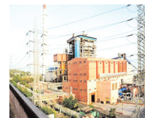
REC Power Development and Consultancy Limited (RECPDCL), a wholly owned subsidiary of public sector finance giant REC Limited. Another power transmission project for which Tata Power Company Limited was the successful bidder was cleared for Uttar Pradesh. SPV Jalpura Khurja Power Transmission Limited has been formed for the con-

The way has been cleared for starting work on the inter-state power transmission project in the Kallam area of Maharashtra which forms part of the Western Region Network Expansion Scheme, the Ministry of Power announced on Saturday. The special purpose vehicle (SPV) Kallam Transco Limited that has been formed for setting up the project has been handed over to M/s Indgrid 2 Limited & Indgrid 1 Limited (consortium), the successful bidder for the project. The bidding process was carried out by