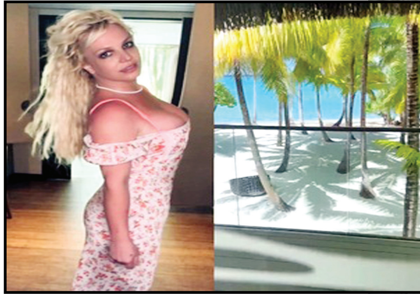
done my nails in two months and I did my first ever laser treatment for my face only a week ago. It kinda hurt though... not a fan"

"I believe in God again every time I go to this destination and there probably isn't another person that feels as blessed as I do every darn time I leave!!! But I will back sooner this time!!! Game of chess!! When people say we are so happy for you I'm like well how come you all got offended when I wasn't in the coffin at my funeral ??? Jk." Last month, she let fans into her beauty regime as she revealed she has undergone laser treatment on her face. The Toxic hitmaker recently dyed her hair a lighter blonde shade and indulged in some 'self care' and updated fans on Instagram. She revealed that she's a fan of all her recent treatments though as the new lighter hair do isn't to her taste as she revealed she hates her new hair and wants to change it. Sharing a selfie on Instagram, Britney wrote: "I haven't been really good with my self-care... I haven't