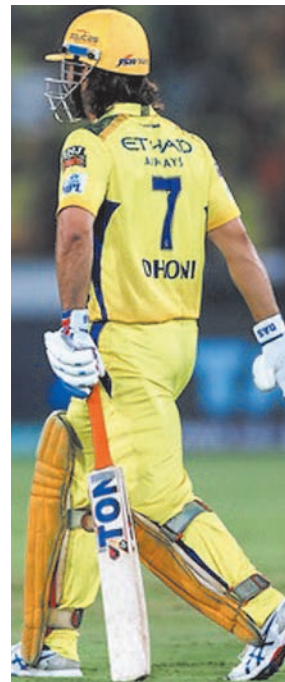
win against CSK as he

Sunrisers Hyderabad (SRH) skipper Pat Cummins was stunned after listening to the cheering of the packed Rajiv Gandhi International Stadium for MS Dhoni when he came out to bat in the 20th over of Chennai Super Kings (CSK) inning on Friday. "The crowd was crazy tonight. When MS walked out, it was as loud as I've ever heard, but yes we love playing here and we made it two from two." Cummins said in the post-match presentation ceremony. However, Dhoni scored just one run off two deliveries but it was a moment of delight for the spectators who came out to watch him bat. Cummins was instrumental in SRH's six-wickets