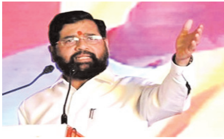
best wishes to the BJP, may it continue to prosper under the leadership of Prime Minister Narendra Modi," the Chief Minister said in an X post. He also said the BJP has achieved the historic feat of freeing the country

Shiv Sena leader and Maharashtra Chief Minister Eknath Shinde on Saturday wished Prime Minister Narendra Modi, Home Minister Amit Shah, BJP President J.P. Nadda, and all the party functionaries on the Foundation Day of the BJP (April 6, 1980). In a bid to keep Shiv Sena's alliance with the BJP going, CM Shinde said the bond between the two parties will only get strengthened further. "Shiv Sena has been in tune with the ideology of the Bharatiya Janata Party (BJP) since its inception. I assure you that this bond will remain strong and the two parties will collectively promote democratic values. My