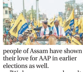
Guwahati

Delhi Minister Atishi claimed on Monday that if Arvind Kejriwal decides to join the BJP, he would walk out of jail within a day.