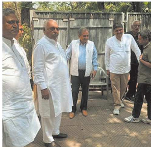
son Brijendra resigned as a BJP MP and joined the Congress citing "compelling political reasons".

Singh's induction into the Congress is seen as a move to woo the Jat voters in Haryana, Rajasthan, and western Uttar Pradesh. On March 10, Singh's