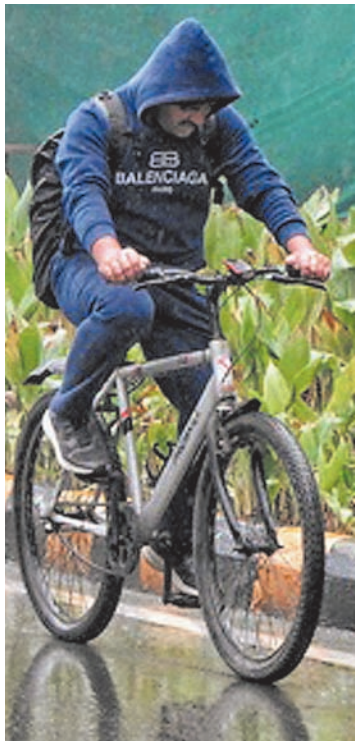
(87 cm), he said. Positive Indian Ocean Dipole conditions are predicted during the monsoon season.

India is likely to see above-normal rainfall in the four-month monsoon season (June to September) with cumulative rainfall estimated at 106 per cent of the long-period average