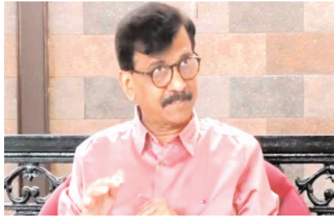
some Congress people are furious in Sangli, then it is the responsibility of top leadership to explain them...We will try our best to win Sangli's seat." Thorat previously claimed in March that the Sena should not have announced candidates for Mumbai South Central and Sangli. "These were still being discussed."

Shiv Sena (UBT) leader Sanjay Raut asserted on Friday that all 48 Lok Sabha seats in Maharashtra belong to MahaVikasAghadi and not exclusively by any single constituent. His comments came in response to Congress leader BalasahebThorat's worry about the Uddhav Thackeray faction releasing candidates for seats that were still being debated, including the Sangli seat. Raut told reporters in Mumbai, "All the 48 seats in Maharashtra belong to MahaVikasAghadi and not particularly to Shiv Sena (UBT) or Congress. Shiv Sena (UBT) has a clear vision of winning all the seats in the MVA." Commenting on Thorat's statement, Raut, a member of the MVA negotiation committee, said, "Some people could be furious about Shiv Sena having a Sangli seat... Amravati and Kolhapur were our seats, but we explained to our workers... If