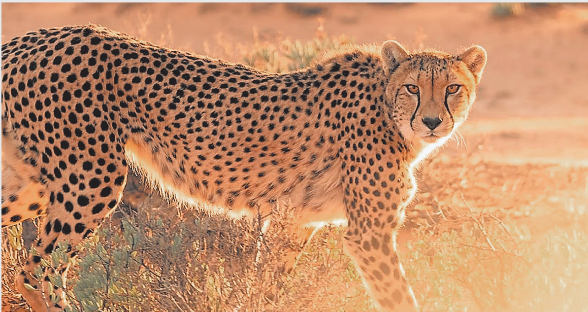
rooms for the tourists in Kuno National Park. We have three tourist gates which include Ahera Gate, Tiktoli Gate and

"We are trying to provide all the facilities, including wash-