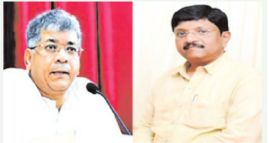
Team Absolute | Amravati