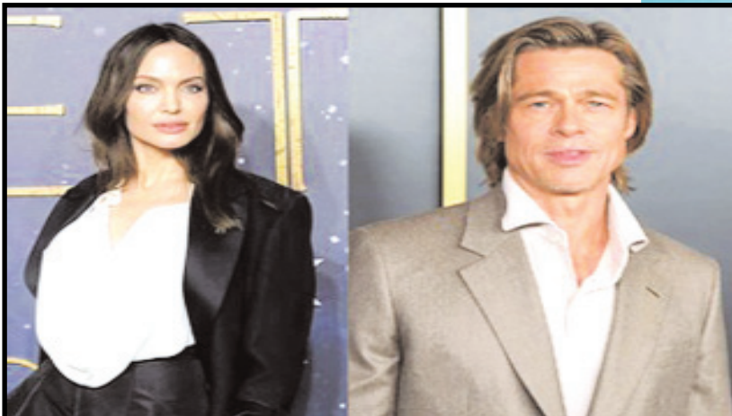
2022 lawsuit against Jolie for selling her shares of the winery to another party. The documents also claim that Jolie "never pressed charges" against her "Mr. & Mrs. Smith" co-star because "she believed the best course was for Pitt to accept responsibility and help the family recover from the post-traumatic stress he caused." However, a source familiar with Pitt said that Jolie "continually tries to distract from legal losses by offering irrelevant or inaccurate information" in further court filings. "There's a pattern that every time she loses, she continues to come back to this... there's nothing new here," the source added.

"By refusing to buy her interest but then suing her, Pitt put directly at issue why that NDA was so important to him and what he hoped it would bury: his abuse of Jolie and their family," he continued, referencing Pitt's