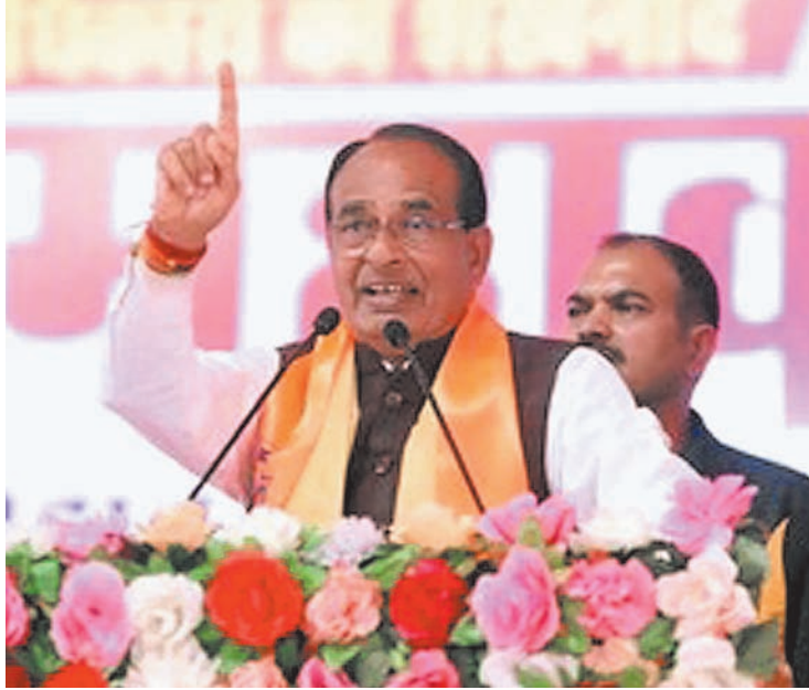
the reason why they are crying hoarse," he said.

Former Madhya Pradesh chief minister Shivraj Singh Chouhan on Friday said that not democracy but the Congress party is in danger of 'disappearing into oblivion'. Chouhan, speaking to the Press, said that Congress leaders are making weird statements out of desperation and over failure to drum up public support despite canvassing. Taking objection to Rahul's 'nation will be on fire if BJP wins' remarks, the senior BJP leader asked, "What does he want to convey, does Congress party want to set the country ablaze, does Sonia Gandhi support Rahul's statement?" He said that Congress has nothing left on the ground, hence it is resorting to such unwarranted remarks. Further shredding the grand old party over its charges of 'democracy being diminished and weakened', Chouhan said that democracy was getting strengthened under the Modi government. "Today, if any entity that feels threatened or finds itself in dire straits, it is the Congress. And that is