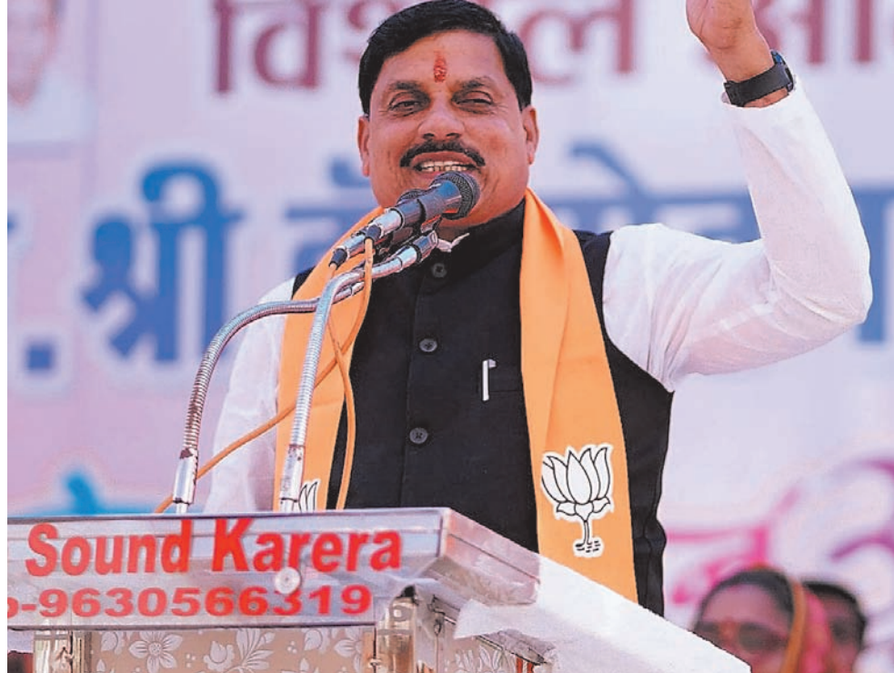
Dr. Mohan Yadav said that Congress wants to grab the property of the poor, tribals, backward people and Dalits of our country. He has said in his manifesto that he will conduct an economic survey of the resources in this country. Rahul Gandhi's

The party raised objection. This is the thinking of Congress. Congress never cared about the country, they only cared about saving one family.