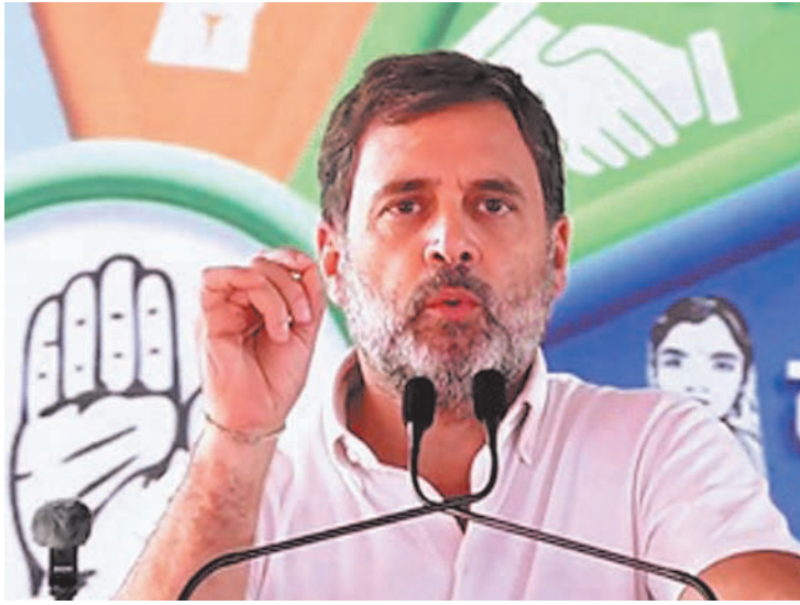
Team Absolute | Seoni

Former national president of Congress Rahul Gandhi promised in Dhanora of Seoni district of Mandla parliamentary constituency that as soon as the Congress government is formed at the Centre, recruitment will be done on 30 lakh vacant posts.