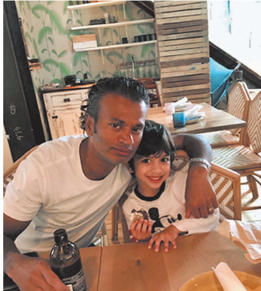
Simpsons by a philanthropic banker.

In a dramatic reversal of fortunes, Sashi ended up from the floors of the Coimbatore cinema theatre that he cleaned for the privilege of sleeping on them at night, to the upscale Toronto suburb of Forest Hill, where he started living in a 22-room mansion with 32 other children from South Korea, Spain, India, Vietnam, China, Cambodia and Bangladesh, according to 'Global Indian Times'. The mansion had been gifted to the