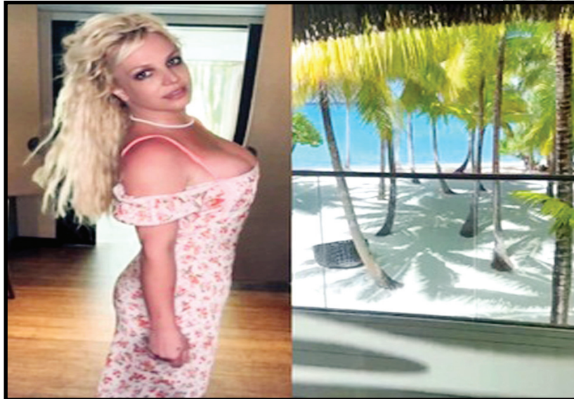
done my nails in two months and I did my first ever laser treatment for my face only a week ago. It kinda hurt though... not a fan"

"I believe in God again every time I go to this destination and there probably isn't another person that feels as blessed as I do every darn time I leave!!! But I will back sooner this time!!! Game of chess!! When people say we are so happy for you I'm like well how come you all got offended when I wasn't in the coffin at my funeral ??? Jk." Last month, she let fans into her beauty regime as she revealed she has undergone laser treatment on her face. The Toxic hitmaker recently dyed her hair a lighter blonde shade and indulged in some 'self care' and updated fans on Instagram. She revealed that she's a fan of all her recent treatments though as the new lighter hair do isn't to her taste as she revealed she hates her new hair and wants to change it. Sharing a selfie on Instagram, Britney wrote: "I haven't been really good with my self-care... I haven't