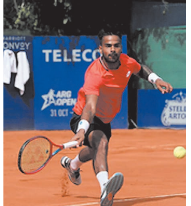
best career win (by ranking of opponent). Nagal will next face the winner of the match between Diego Schwartzman and third seed Diaz Acosta.

From the start, Nagal put up a professional effort, exhibiting deft groundstrokes and superb court coverage. He kept Cobolli on the back-foot with his thunderous forehand. In the first set, Nagal took the lead with a break of serve in the fourth game and held onto the lead to win 6-2. Cobolli fought with more vigour in the second set. But in the eighth game, the Indian star answered forcefully with a serve break, demonstrating his mental toughness. With confidence, Nagal ended the match with a 6-3 score. This was his ninth top-100 win (seventh on Clay) and fourth-