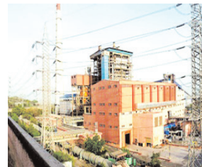
REC Power Development and Consultancy Limited (RECPDCL), a wholly owned subsidiary of public sector finance giant REC Limited. Another power transmission project for which Tata Power Company Limited was the successful bidder was cleared for Uttar Pradesh. SPV Jalpura Khurja Power Transmission Limited has been formed for the con-