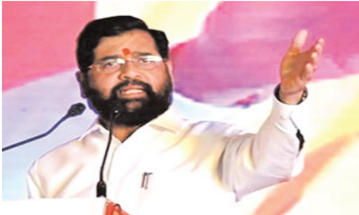
best wishes to the BJP, may it continue to prosper under the leadership of Prime Minister Narendra Modi," the Chief Minister said in an X post. He also said the BJP has achieved the historic feat of freeing the country

Shiv Sena leader and Maharashtra Chief Minister Eknath Shinde on Saturday wished Prime Minister Narendra Modi, Home Minister Amit Shah, BJP President J.P. Nadda, and all the party functionaries on the Foundation Day of the BJP (April 6, 1980). In a bid to keep Shiv Sena's alliance with the BJP going, CM Shinde said the bond between the two parties will only get strengthened further. "Shiv Sena has been in tune with the ideology of the Bharatiya Janata Party (BJP) since its inception. I assure you that this bond will remain strong and the two parties will collectively promote democratic values. My