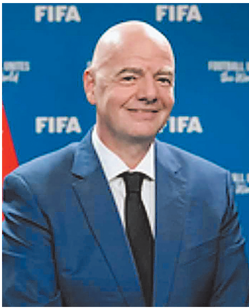
remains level and the game free of malevolent

Its main focus is to update them on global integrity trends, share best practices, present the new FIFA Integrity Handbook and Education Roadmap and explore relevant decisions from FIFA and the Court of Arbitration for Sport (CAS) regarding match manipulation. In a video address played during the opening of the summit, Infantino said that, as a multi-billion-dollar industry, football would always be a tempting target for criminal activity. "We must ensure that the playing field