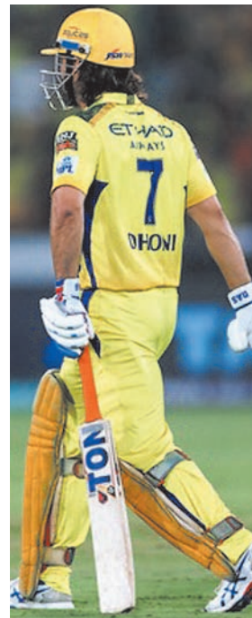
win against CSK as he

However, Dhoni scored just one run off two deliveries but it was a moment of delight for the spectators who came out to watch him bat. Cummins was instrumental in SRH's six-wickets