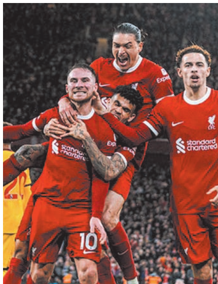
After a loss Sheff Utd remain at the bottom, 10 points behind 17th-placed Nottingham Forest.

Cody Gakpo put the seal on the victory when he headed in an Andy Robertson cross from 15 yards out in the 90th minute as the Reds regained top spot in the standings, two points ahead of Arsenal.