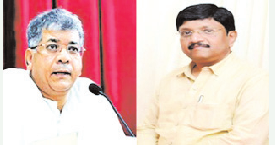
Team Absolute | Amravati