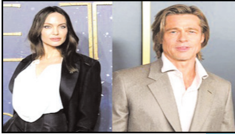
2022 lawsuit against Jolie for selling her shares of the winery to another party. The documents also claim that Jolie "never pressed charges" against her "Mr. & Mrs. Smith" co-star because "she believed the best course was for Pitt to accept responsibility and help the family recover from the post-traumatic stress he caused." However, a source familiar with Pitt said that Jolie "continually tries to distract from legal losses by offering irrelevant or inaccurate information" in further court filings. "There's a pattern that every time she loses, she continues to come back to this... there's nothing new here," the source added.

"By refusing to buy her interest but then suing her, Pitt put directly at issue why that NDA was so important to him and what he hoped it would bury: his abuse of Jolie and their family," he continued, referencing Pitt's