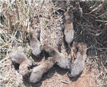
Gamini has given birth to six cubs, a record of sorts for a first-time mother."

He further wrote, "A week after the news of Gamini giving birth to five cubs, it has now been confirmed that South African cheetah