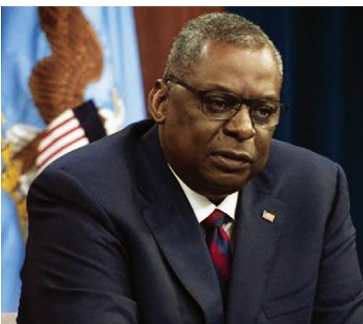
He faced questions that were divided between potential responses to the deadly drone attack and his handling of the medical condition. Biden Reaches Decision on Response to Drone Attack: Austin said that he was still working through leg pain and that he is undergoing physical therapy. But