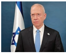
and attacking Israel. Gallant had visited the IDF's 98th division command in Khan Younis on Wednesday and had addressed troops. Addressing troops, the defense minister said: "IDF's operations in Khan Younis were 'progressing with impressive results,' and that it was 'much more difficult for Hamas.'" He said: "They (Hamas) don't have weapons, ammunition, ability to treat the wounded, they have 10,000 dead terrorists (throughout Gaza) and another 10,000 wounded who are not functioning."

Tel Aviv | Agencies Israel Defense Minister Yoav Gallant has said that the Israel forces would soon reach Rafah border and eliminate Hamas units in the border areas. In a statement late Thursday night, Gallant said that the ongoing operations have severely weakened the terror group's ability to wage war. He said that the fire power and force displayed by the Israel army so far during the war has put huge pressure on Hamas, forcing it to agree to release hostages it held during October 7 attack. The Israel Defense Minister, considered a hawk in Israel cabinet, said that Hamas' Khan Younis Brigade had boasted that it would stand against the IDF, but it is falling apart. After completing the mission in Khan Younis, the IDF would reach Rafah and eliminate everyone there who is a terrorist