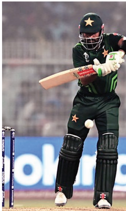
New Zealand's bowlers proved effective, capitalizing on the wickets secured by Tim Southee (4-25) and Ben Sear (2-42). Despite Babar's individual milestone, the collective effort fell short, leaving Pakistan trailing 1-0 in the five-match series.

However, the rest of the batting lineup faltered, and Pakistan found themselves bundled out for 180 in 18 overs.