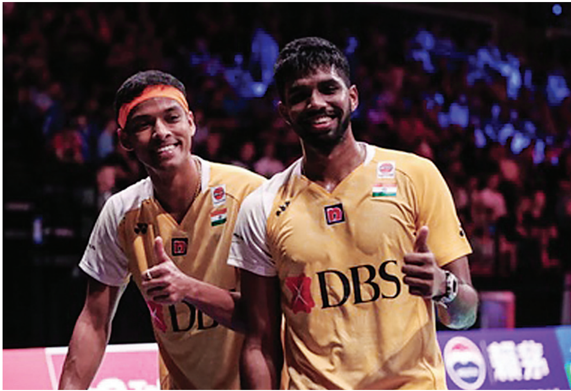
The match concluded with the Indian duo earning a dozen match points, and they secured their victory at the second opportunity.

The second game mirrored the first, with Satwik and Chirag maintaining their dominance and extending their lead to 11-4 at the interval. The synergy between the Indian shuttlers was evident, blending speed, precision, and tactical acumen to keep their opponents at bay. The Chinese pair found it challenging to counter the relentless attacks and strategic play of Satwik and Chirag.