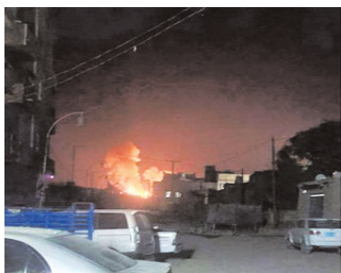
Saba news agency, strikes were also carried out in the governorates of Hodeidah, Saada, and Dhamar.

The strikes "targeted Al-Dailami air base in Sanaa, areas in Zabid District of Hodeidah province, the vicinity of the airport of Hodeidah port city, Kahlan Camp in the east of northern Saada city, and the airport of Abs district in the northwestern governorate of Hajjah", it said.