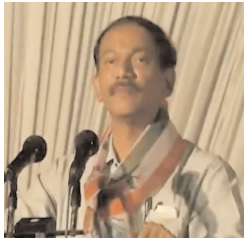
Constitutional post of the Speaker has brazenly and conveniently ignored the SC's directions to