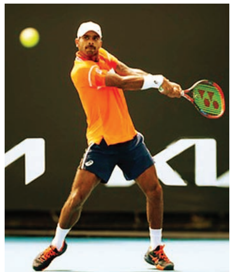
took place at the Australian Open in 2021, where he faced an opening-round defeat with a scoreline of 2-6, 5-7, 3-6 against Lithuania's Ricardas Berankis.

Nagal's last appearance in the main draw