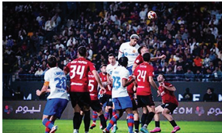
end Ferran Torres shot just wide from outside of the penalty area. Osasuna responded quickly with right back Jesus Areso shooting

Barcelona were far from brilliant, but created more chances than their rivals. The first half began at a ferocious pace, with Jose Arnaiz almost setting up Ante Budimir in front of the Barcelona goal, while at the other