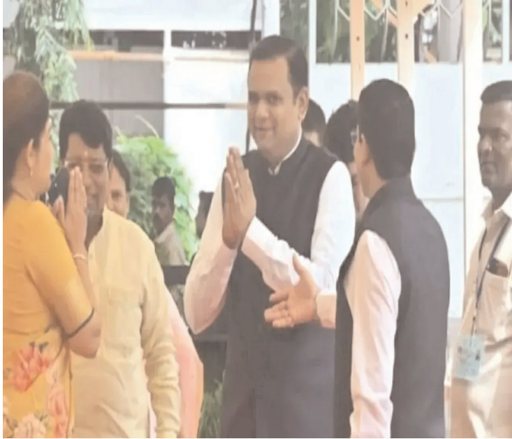
"I had to decide which of the two groups in the legislature represents the original political party. No party can have two whips. So Thackeray faction MLAs have to adhere to the whip recognised by me," Narwekar

Narwekar has come under intense criticism from the opposition, especially the Uddhav Thackeray-led Shiv Sena (UBT) for recognising the Shinde outfit as the "real" Shiv Sena. Thackeray has termed the verdict a "murder of democracy" and said his party will move the Supreme Court against it.