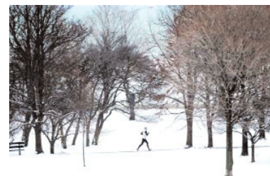
will likely fail to reach zero degrees across much of Montana and North Dakota.

High temperatures in the single digits and 10s will then spread east into parts of the central Plains and Midwest.