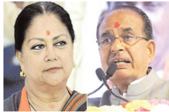
Union minister Narendra Singh Tomar the Speaker of the Madhya Pradesh Legislative Assembly.

Out of these 12 leaders, Arun Sao has been made the deputy chief minister of Chhattisgarh and Diya Kumari the deputy chief minister of Rajasthan, while it has been decided to make former