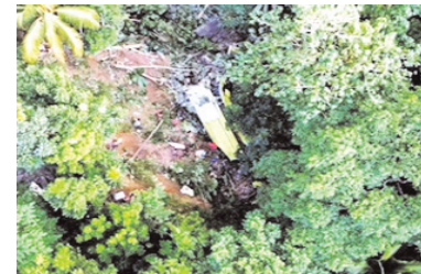
The deaths include the bus driver and

The bus, carrying 53 passengers, was travelling west from Iloilo City to San Jose de Buenavista in Antique province when it crashed into a concrete road barrier before plunging into a ravine shortly before 5 p.m. local time on Tuesday in Hamtic town.