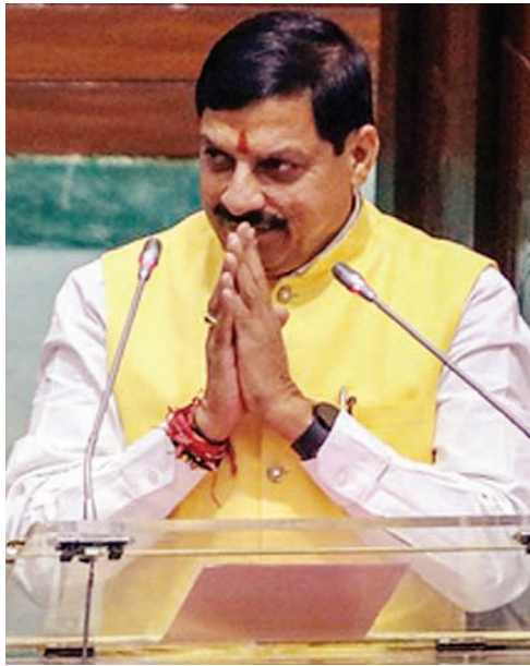
Singh Chouhan, who headed the state for over 16 years, Yadav is trying to win the confidence of his party colleagues.

Well-aware of the fact that his governance would be compared with that of his predecessor Shivraj