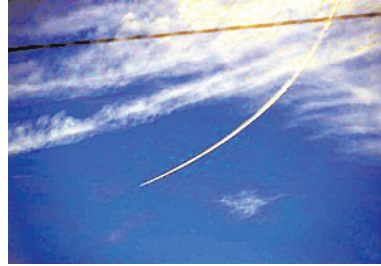
Even though Hezbollah is firing rockets and missiles into Israel on regular intervals and being counter-attacked, the possibility

According to Arab media outlets, Hezbollah has claimed of targeting Israeli military position near a Navy base in the area.