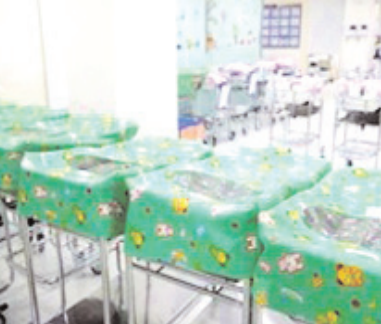
cent from a year earlier, marking the smallest number on record during the cited period.

In the first 10 months of the year, the number of newborns stood at 196,041, down 8.1 per