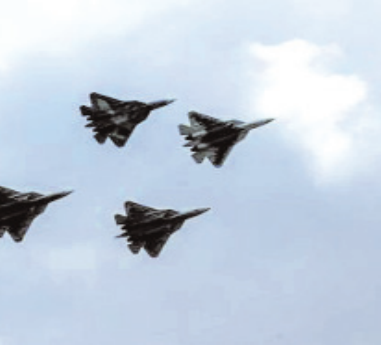
local media. He noted that some orders have increased significantly, and the production of Su-57

"We have fulfilled the state defence orders. We have fulfilled all signed contracts according to the schedule. Everything has been delivered on time, and sometimes even ahead of the schedule," he told