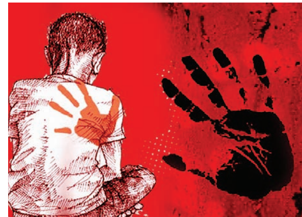
Team Absolute | New Delhi

In a heart-rending incident, a nine-year-old girl in north Delhi was kidnapped, raped, and killed and her body dumped into a canal, police said on Tuesday, adding that