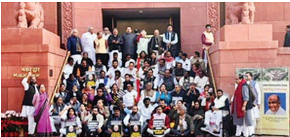
Team Absolute | New Delhi

With the fresh suspension of 49 MPs from the Lok Sabha for the remainder of the Winter Session, the Opposition's Indian National Developmental Inclusive Alliance (INDIA) bloc has lost almost two-third of its strength in the House. The INDIA bloc MPs had been protesting in the House, demanding a statement from Union Home Minister Amit Shah, on the December 13 Parliament security breach. Tuesday's suspension of 49 MPs follows Monday's suspension of 33 MPs. Earlier on December 14 as many as 13 MPs were suspended from the Lok Sabha. Now, the total Lok Sabha MPs suspended stands at 95 out of 138 MPs of the INDIA bloc parties as only 43 MPs are left in the House. Now, only nine MPs of the Congress, including former party presidents Sonia Gandhi and Rahul Gandhi, are left in the House.