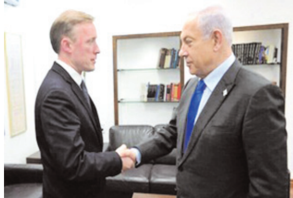
The two met in the Israeli Defence Ministry in Tel Aviv to discuss the Israeli offensive in Gaza, its border conflict with Lebanon, and dozens of

Speaking to the press alongside Sullivan, Israeli Defence Minister Yoav Gallant said that the war against Hamas "will require a long period -- it will last more than several months", Xinhua news agency reported.