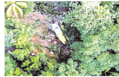
The deaths include the bus driver and

Manila | Agencies At least 25 persons were killed when a passenger bus plunged off a cliff in Antique province in central Philippines, local media reported. The bus, carrying 53 passengers, was travelling west from Iloilo City to San Jose de Buenavista in Antique province when it crashed into a concrete road barrier before plunging into a ravine shortly before 5 p.m. local time on Tuesday in Hamtic town.