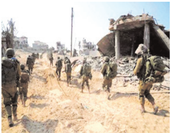
The IDF has also claimed that most of the middle rung leaders Hamas have been killed since Israel began its ground offensive in Gaza. Israel has killed over 15,000

Tel Aviv | Agencies The Israel Defense Forces (IDF) on Wednesday said that they have surrounded the house of Hamas senior leader Yahya Sinwar in Khan Younis area of Gaza. "We have surrounded his house but could not locate Sinwar. He has gone into hiding," a top IDF ranking officer told reporter. The IDF has claimed that Mohammed Deif and Yahya Sinwar -- Hamas' two top leaders -- are allegedly behind mastering the October 7 attacks on southern Israel. The IDF officer told IANS that Sinwar has gone hiding in the Hamas tunnel network in southern Gaza. The Israel Defense Minister Yoav Gallant has said that IDF will search for Sinwar.