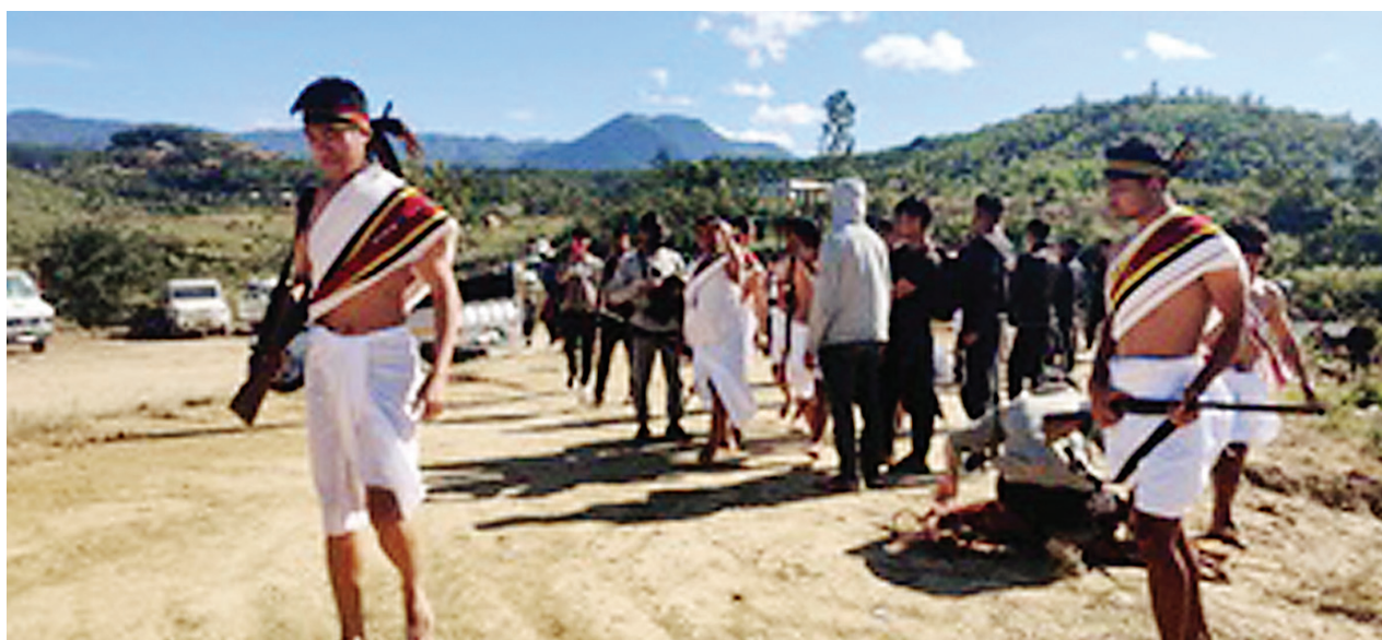
in tribal dominated Churachandpur. Amid the heavy security and prohibitory orders in Churachandpur district, the mass burial took place following the customary and religious rituals and numerous performances.

The tribal volunteers gave gun salutes in respect towards the slain people, whom they termed as "martyrs". Before the burial, a condolence service and mass prayers were organised at the ground in Tuibuong