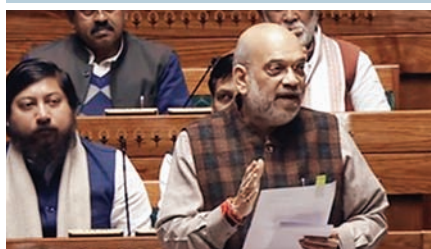
Team Absolute | New Delhi

The Lok Sabha (LS) on Tuesday passed three amended criminal bills -- Bharatiya Nyaya (Second) Sanhita, 2023; Bharatiya Nagarik Suraksha (Second) Sanhita, 2023; and Bharatiya Sakshya (Second) (BSB) 2023. The Lok Sabha also passed the Telecommunications Bill, 2023, with voice vote. The three Bills were passed after Home Minister Amit Shah spoke in the House and majority of MPs present in the Lower House voted in favour of the bills by voice vote.