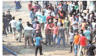
Chairman Tarique Rahman has announced the movement as its demand for national polls under a non-party caretaker government remains unmet.