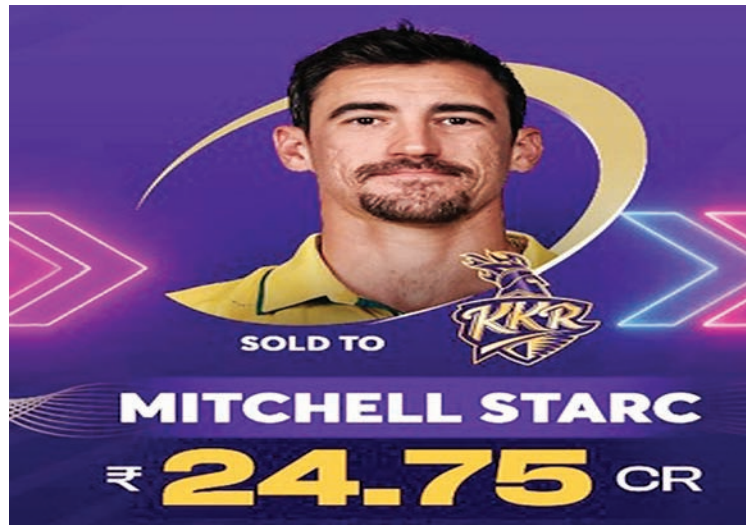
Healy, who is in India leading the Women's team in a multi-format series against Harmanpreet Kaur's Indian team, faced questions on the

Starc was picked by Kolkata Knight Riders for a record-breaking bid of Rs 24.75 crore on Tuesday. He broke the record set a few minutes before by his World Cup-winning captain Pat Cummins, who became the first player to breach the Rs 20 crore mark when he was picked by Sunrisers Hyderabad for Rs 20.50 crore.