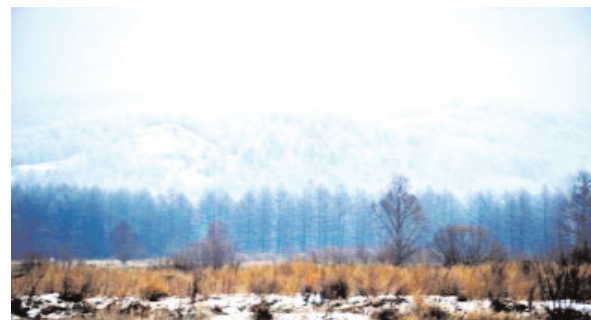
said in a statement on Wednesday. Since the beginning of last week, a strong cold front that

The figure marked the coldest temperature in Mongolia this winter, the National Agency for Meteorology and Environmental Monitoring