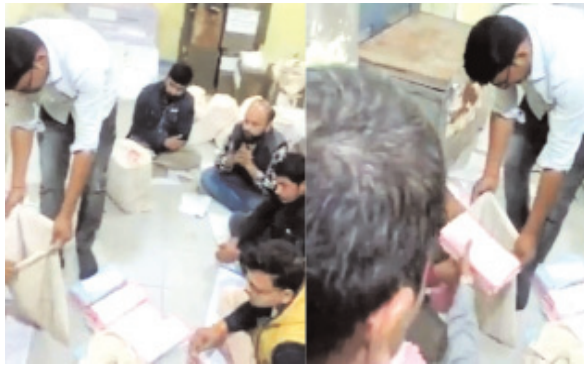
on November 17, while counting of votes will be held on December 3.

A day earlier, the Congress had submitted a memorandum to the state's chief electoral officer seeking action against the Balaghat collector for allegedly taking postal ballots out of the strongroom. The state went to the polls