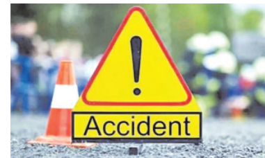
contacted an ambulance, and transported the injured passengers to the district hospital.

As soon as the police received the information, they responded quickly,