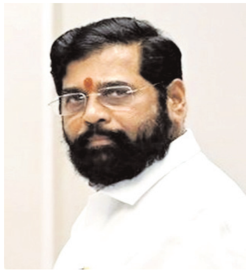
"Instead of giving jobs, we want to create job-givers. I am satisfied that Balasaheb Thackeray's dream of Maharashtra becoming a job-giver is

Maharashtra Chief Minister Eknath Shinde has ordered an assessment of crop losses caused by unseasonal rain in Maharashtra and payment of compensation to affected farmers. Authorities have been directed to conduct the panchama of the damaged crops and affected farmers should be paid adequate compensation," CM Shinde said.