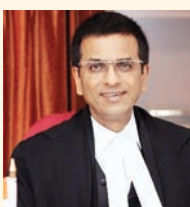
D.Y. Chandrachud, CJI

"Chief Justices of the High Courts shall register a suo motu case with the title 'In Re: designated courts for MPs/MLAs' to monitor early disposal of criminal cases pending against the members of Parliament and Legislative Assemblies."