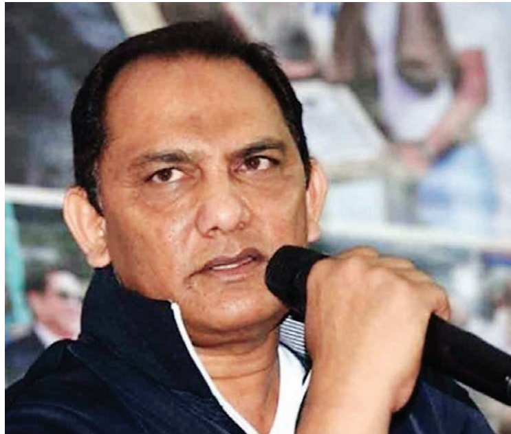
joined the Congress. He will contest again from Munugode, where he lost the by-poll late last year as BJP candidate. He had quit the Congress and