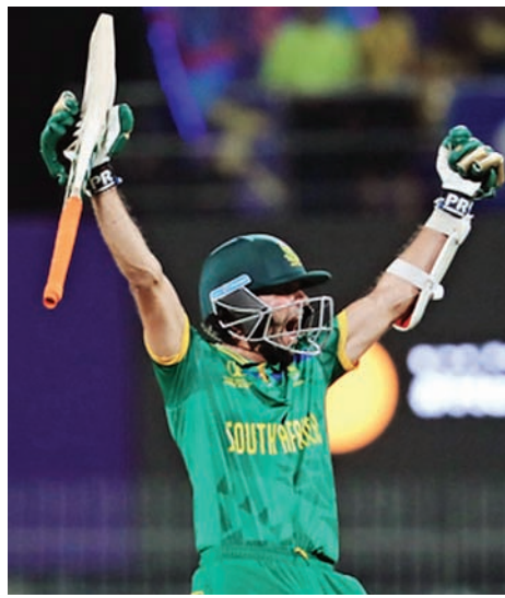
Chennai

Adrian Markram scored 91 but South Africa nearly made a hash of a modest chase as they lost three wickets for 10 runs before Keshav Maharaj (7 off 21) and Tabraiz Shamsi (4 off 6) saw through to a one-wicket victory, their first victory against Pakistan in 24 years in a nail-biting finish in Match 26 of the ICC Men's ODI