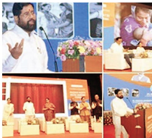
Mantri Awas Yojana, and others. "For the first time in history, PM Modi launched a nutrition tracker to check whether mothers and children are getting proper nutrition services. In the last one and a half years, the Maharashtra government has also taken concrete steps for the welfare of women, to empower them, like the 'Lek Ladki'

He pointed out that through Prime Minister Narendra Modi's efforts, the women have got reservations in parliament and assemblies, lakhs of toilets were built in households under the Swachh Bharat Abhiyan, the names of women have appeared under homes through the Pradhan