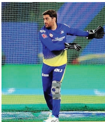
2024. After CSK won their fifth IPL crown, Dhoni subsequently underwent surgery on his knee.

Despite retiring from international cricket, the former skipper remains an active player for IPL franchise Chennai Super Kings and led the side to its 5th title in 2023 during which he was marred by a knee injury which limited him to cameo appearances with the bat. But, he had promised his fans that he would return in IPL