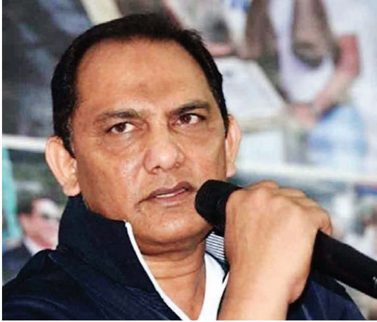
joined the Congress. He will contest again from Munugode, where he lost the by-poll late last year as BJP candidate. He had quit the Congress and

With this, the Congress has announced a total of 100 candidates. The party has decided to leave two seats each for CPI and CPI-M while the candidates for remaining 15 seats are likely to be announced next week. Raj Gopal Reddy's candidature was announced hours after he re-