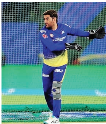
2024. After CSK won their fifth IPL crown, Dhoni subsequently underwent surgery on his knee.

Despite retiring from international cricket, the former skipper remains an active player for IPL franchise Chennai Super Kings and led the side to its 5th title in 2023 during which he was marred by a knee injury which limited him to cameo appearances with the bat. But, he had promised his fans that he would return in IPL