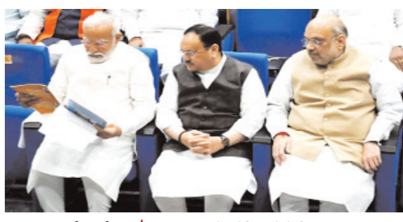
Team Absolute Bhopal

D JP Central Election Committee (CEC) meeting, to be held on Wednesday (September 13), may finalise second list of candidates for the upcoming Madhya Pradesh assembly elections, sources said.