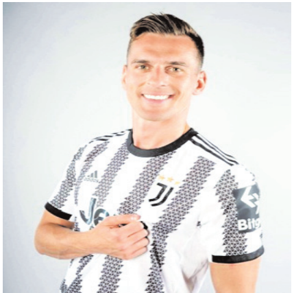
Juventus temporarily climbed to second place with 13 points, one point ahead of AC Milan, who will face Cagliari on Wednesday.

Juventus rebounded from their 4-2 defeat to Sassuolo as Arkadiusz Milik's goal secured a 1-0 victory over 10-man Lecce. Juventus, sitting in fourth with 10 points prior to Tuesday's game, faced an unexpectedly strong Lecce side that had remained unbeaten and occupied third place, reports Xinhua. Juventus controlled the match, crafting multiple opportunities but struggled to score. Their breakthrough came in the 57th minute when Weston McKennie floated a pass to Adrien Rabiot, who headed it down for Milik to tap in at the back post. Late in the game, Lecce's Mohamed Kaba fell in the penalty area under pressure from Federico Chiesa. However, instead of earning a penalty, Kaba received his second yellow card for simulation and was subsequently dismissed. With this victory,