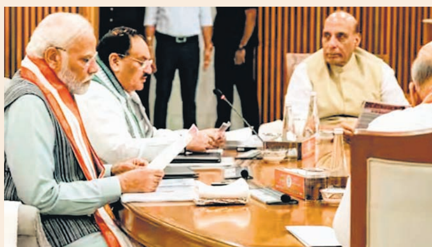
Among the prominent candidates whose names were approved by the BJP election committee, Madhya Pradesh Congress President Kamal Nath's Chhindwara city

A decision on the names of three candidates will be taken after discussion with some leaders of the state. Home Minister Amit Shah has been given the responsibility of deciding the names of three candidates after discussion. The BJP's Central Election Committee meeting was attended by PM Modi, Union Ministers Amit Shah and Rajnath Singh, MP CM Shivraj Singh Chouhan and other senior leaders.