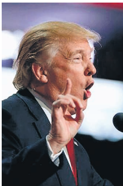
the 4th indictment at Georgia and the ones before it could have their larger than life fig-