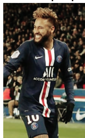
beautiful chapter in his

Neymar has been recalled to Brazil's national squad for the team's opening 2026 FIFA World Cup qualifiers against Bolivia and Peru, the Brazilian football confederation said.