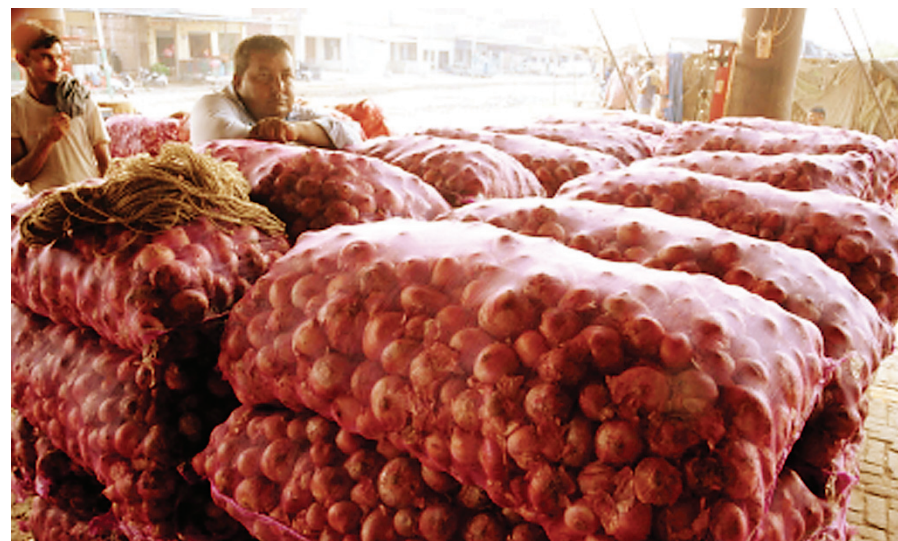
Team Absolute | New Delhi

the National Highway in the area, told PTI that to prevent landslides, concrete blocks had been constructed on the banks of the Alaknanda which had stopped the erosion of the river. The road had since been stable but the rise in the water level in the Alaknanda is making water flow over the concrete blocks which may have led to increased subsidence in the area, Kumar said. Itanagar: Landslides triggered by incessant rains in the past couple of days have snapped road links to several Arunachal Pradesh districts. Continuous landslides have blocked a portion of the Akajan-Likabali-Aalo road at Siji in Lower Siang district. Several vehicles have remained stranded for the past couple of days, a district official said. Though the MSV International Inc, the company constructing the Trans Arunachal Highway (TAH) portion of the road (package I&II), has deployed men and machinery to clear the blockade, continuous rain has hampered restoration work as landslides continued to occur, Lower Siang DC Marto Riba said. While small vehicles were allowed to move after frequent clearing of the blockade, heavy vehicles were not allowed due to continuous landslides and remained stranded for the past couple of days on both sides of the vital road. The road connects Leparada, West Siang, Upper Siang, Siang, Upper Subansiri and Shi-Yomi districts of the state.