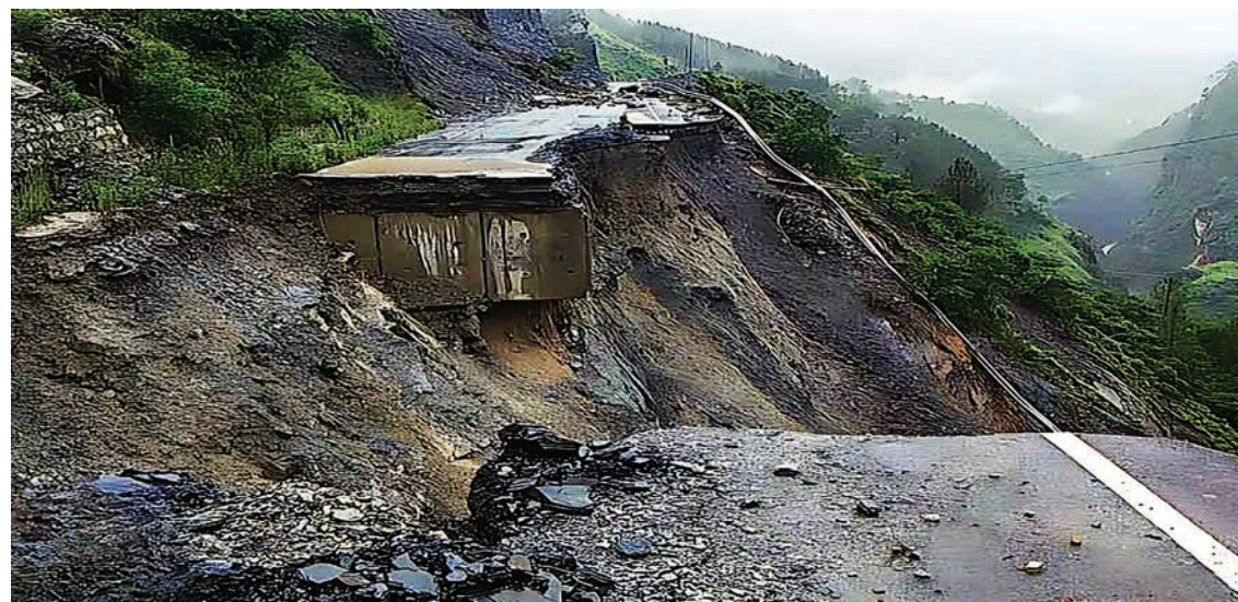
Gopeshwar | Agencies

A stretch about 50 metres long on the Rishikesh-Badrinath National Highway near Pursari village is showing signs of land subsidence with cracks appearing on it. The stretch located between Chamoli and Nandprayag is apparently sinking towards the Alaknanda River. Alarmed by the situation, authorities have warned vehicles coming from the mountainside to go slow. A police team has been deployed on the affected spot to alert the drivers.