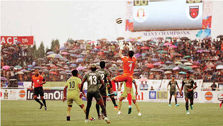
Kokrajhar (Assam) | Agencies