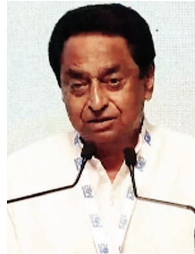
"In the interest of the public, the BJP government is requested to break the

Bhopal: Madhya Pradesh Congress president Kamal Nath on Saturday hit back at the ruling BJP, saying worried of losing the assembly polls, the saffron party has started questioning his "religious belief". In a series of tweets, Kamal Nath, the former chief minister, posted in Hindi: "Nowadays BJP people are more concerned about my faith and belief. The BJP leaders are coining new words like election worship and political hypocrisy and boast of breaking the spell of my magic, It suggest that nothing comes in the mind and heart of BJP people except me." "Instead of chanting my name, the government, its representatives and the BJP should chant the name of the people, worship people as in the country, public is 'Janardan'."