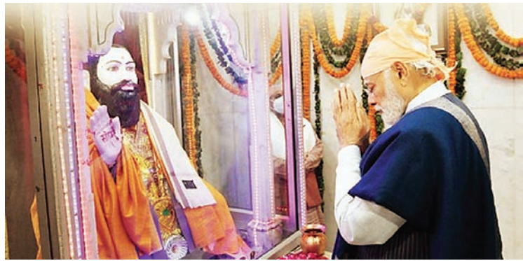
Team Absolute | Bhopal

Modi performs ground-breaking ceremony for the Sant Ravidas Memorial and Art Gallery in Sagar. Sant Shiromani Shri Ravidas was a symbol of social harmony. Kota-Bina double rail line dedicated to people