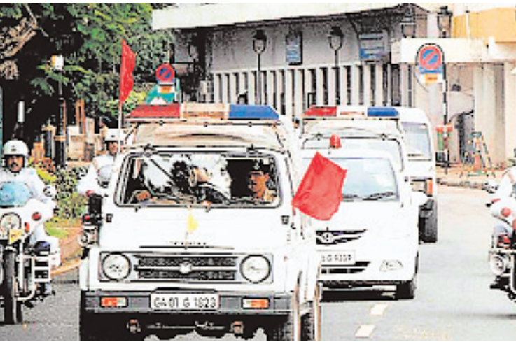
with the offer.

The accused persons took money, passport and other documents from them. They also called the victims to Mumbai for some training and docu-