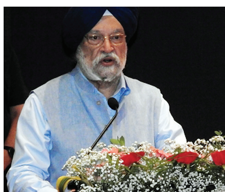
IEA estimated that on the investment front, India needs nearly $150 billion per year in clean energy investment until 2030 to keep on track for its ambitious clean energy transition.

Puri pointed out that reducing technology gaps via advancement in development and deployment of the full range of emerging clean energy technologies requires urgent, collaborative action.